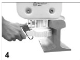
4 Install padlock if required.