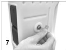
7 Unscrew bolt using key.