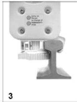
3 Unit installed.