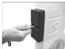
9 Use bolt to withdraw battery box.