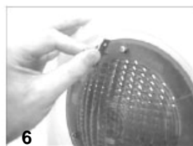
6 Use key to switch on/off.