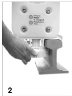
2 Twist cam to lock.