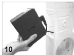
10 Withdraw battery box.