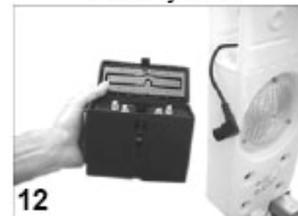
12 Open box to change batteries