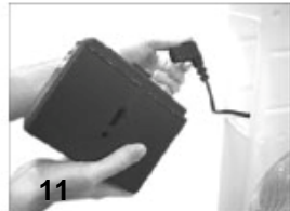
11 Remove plug.