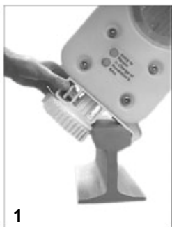
1 Position unit onto track.