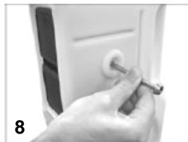
8 Withdraw bolt.